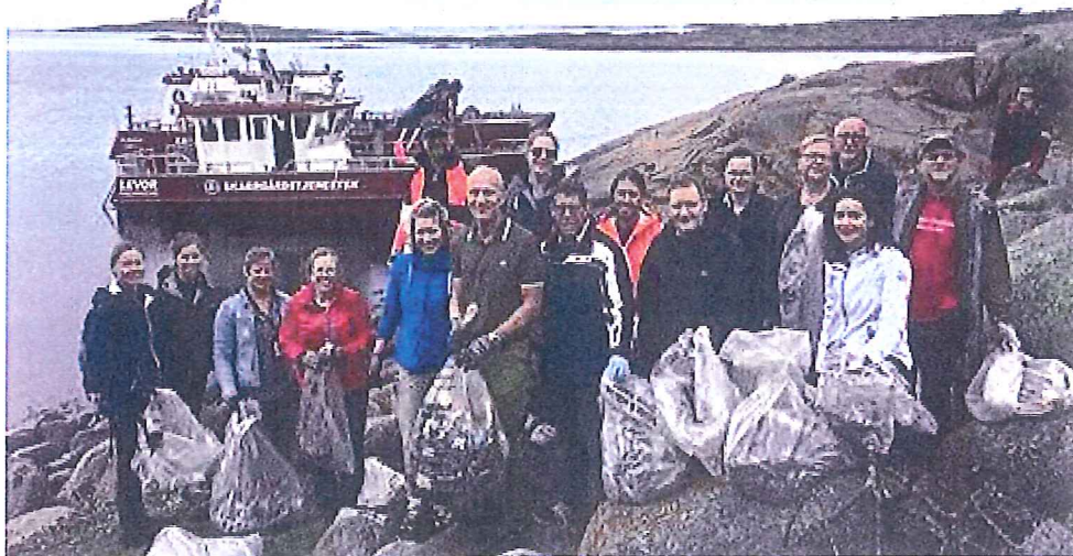
The members of the Marine Resources Group during the beach cleaning activity in Østfold.

The Marine Resources Group (MRG) made an excursion to the Isle of Saueholmen where they cleaned the beach from marine litter. They were joined by the Cathedral of Hope, Interreg project "Clean Coastline", Oslofjord friluftsråd and KIMO International.