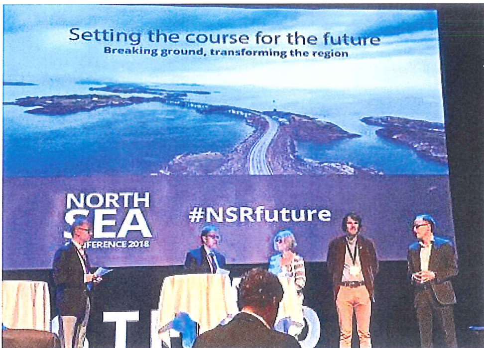
First panel of the North Sea Conference 2018

Read more: Kerstin Brunnström's key note speech